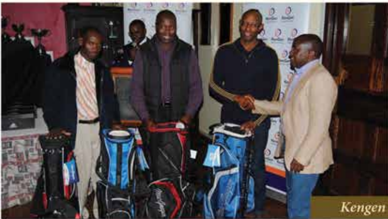
Kengen Golf Day