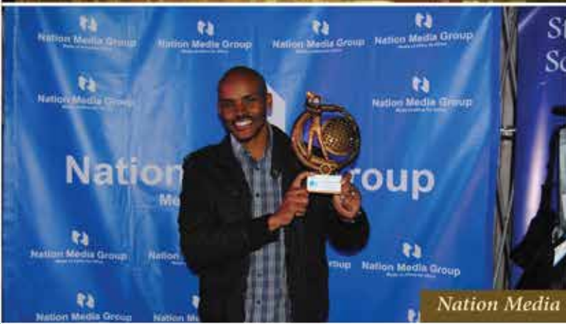
Nation Media Group Golf Day