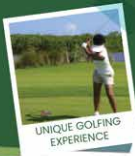
UNIQUE GOLFING EXPERIENCE

Limuru Country Club is a Premier Golf and Country Club in Kenya offering first class Sporting and social amenities in a beautiful and serene environment