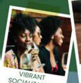
VIBRANT SOCIALIZATION ENVIRONMENT