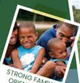
STRONG FAMILY ORIENTATION