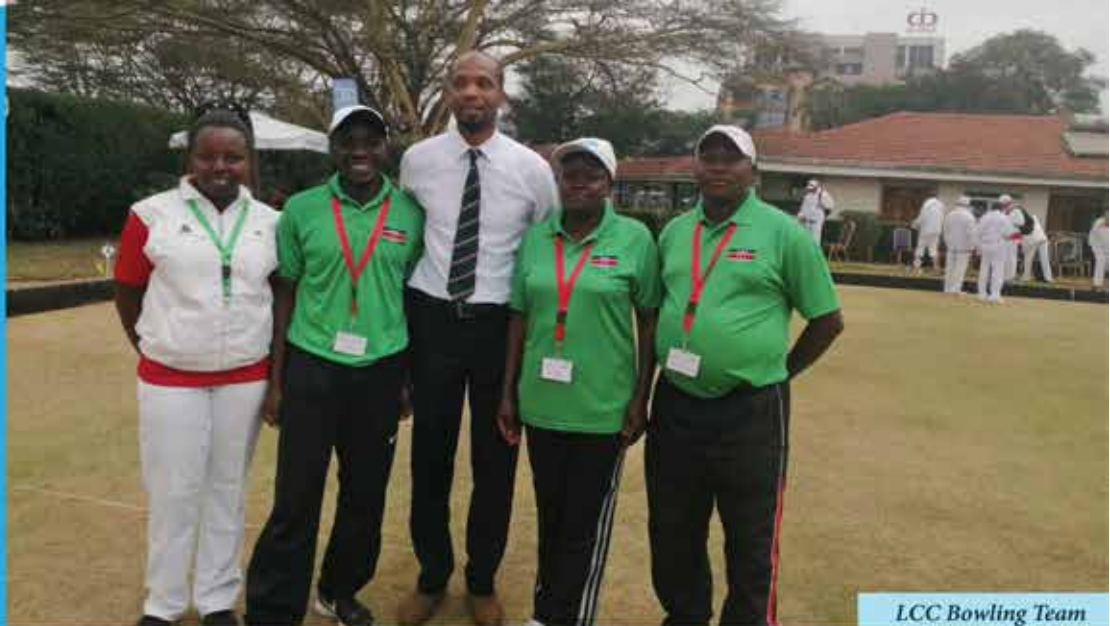
LCC Bowling Team