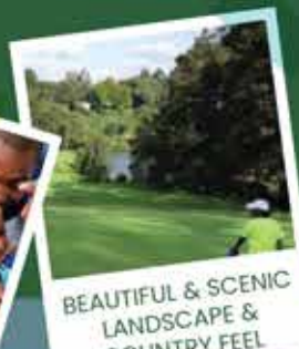
BEAUTIFUL & SCENIC LANDSCAPE & COUNTRY FEEL